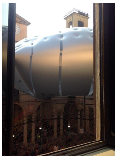
BK86Fw_IgAE368J.jpg size-599 x 804 scale-23.2% copyr-<No data from link>

esquis 2014-04-11 16:12:18 Palazzo Clerici #OnTheFlyMilan http://t.co/ M3qr7vCkr5