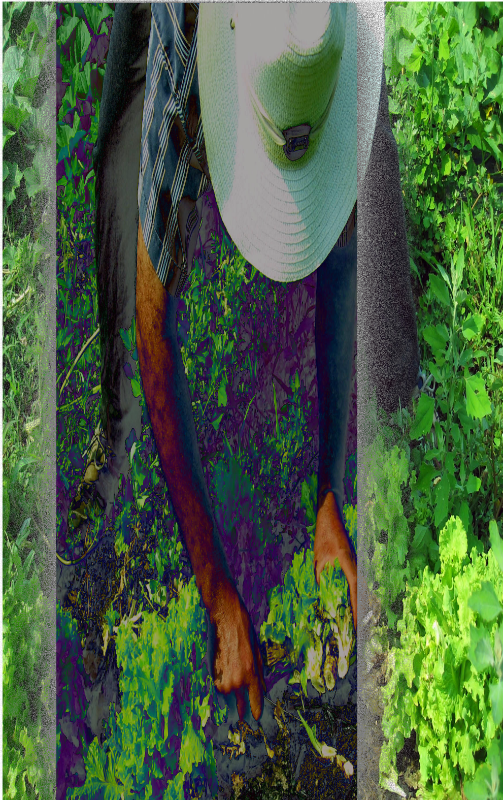
fig. Meroni-2.jpg size. 2272 x 1704 scale. 40.6% x 97.2% RGB copyright. <No data from link>