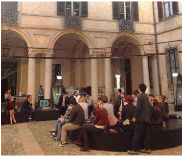
Bk84-tNIUAA_LqL.jpg size-599 x 804 scale-23.2% copyr-<No data from link>

esquis 2014-04-11 16:09:33 The star at #OnTheFlyMilan : The aerostatic dome by Nike http://t.co/hrdilyUGWI