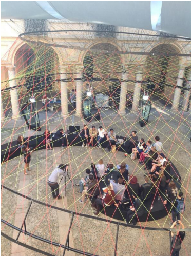
Bk85vVZIYAaqAPH.jpg size-599 x 804 scale-23.2% copyr-<No data from link>