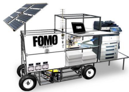
Bk8eBNzCIAAIpve.jpg size-600 x 424 scale-23.1% copyr-<No data from link>

esquis 2014-04-11 16:10:41 The crowd at #OnTheFlyMilan http://t.co/Q1ddUmvqaO